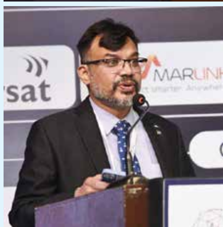
the guests, enlightened them about the background of GlobalMet. He stated that GlobalMet, formed in 1989, in Australia, by a group of maritime education and training (MET) institutions with a mission to work together and help improve MET standards around the