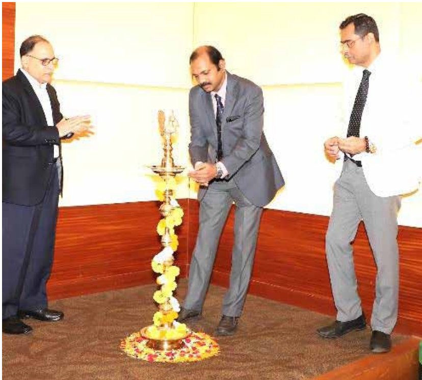
seminar conducted at Maritime Training Institute (MTI), Powai in Mumbai.

Appreciating the cadets for their mind blowing